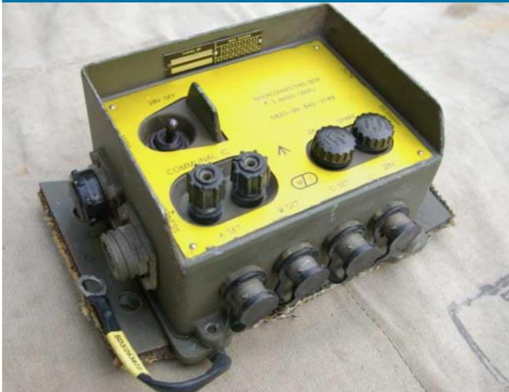
CPU Channel Switch