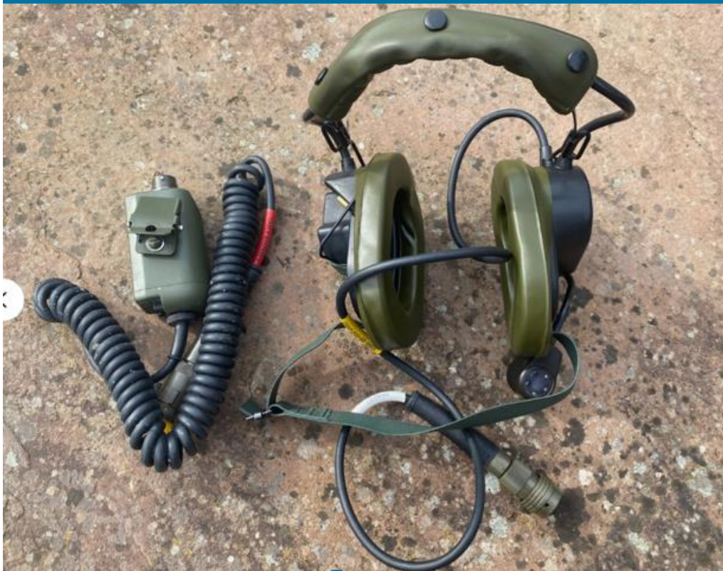
Tank Commander PPT