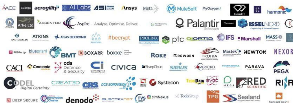
Figure 3. Illustration of Team Defence Information Lead Sponsors, Trade Associations and Member organisations (subject to change), source: Team Defence Information